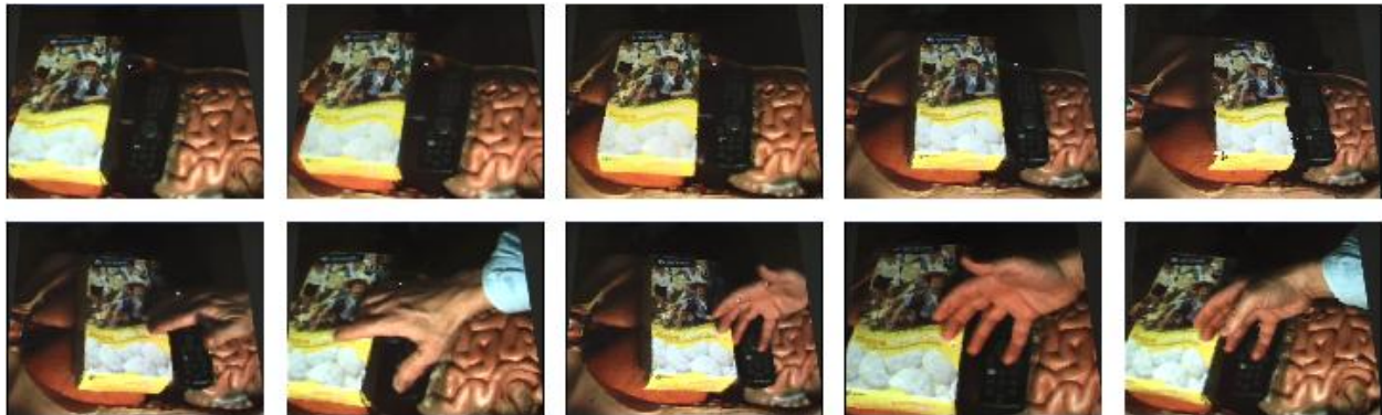
Fig. 4 Novel view images reconstructed from camera images. We set a box of Girl Scout cookies on top of the torso to provide more familiar scene geometry. Each image is from a different point in time and from a completely novel viewpoint that does not coincide with any of the cameras used to acquire the raw data.

Fig. 4 shows some results of our view-dependent pixel coloring (VDPC) 3D reconstruction. The views were reconstructed online, in real time. Note that the views were reconstructed and rendered from completely novel viewpoints. That is, none of the rendered views matched any of the original camera views at any time.