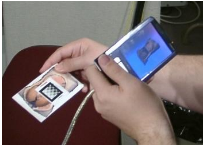
Fig. 2. Handheld prototype. The prototype uses a PointGrey DragonFly [23] camera mounted on the PDA (in the left hand). The prop (in the right hand) has a printed image of our training torso on it, along with a grayscale pattern. We use ARToolkit [24] to track the surrogate with respect to the PDA (remote.)

and a PDA that is tracked relative to the prop. In our prototype, a specially designed PDA cover serves as the prop. The advisor holds the prop (PDA cover) in one hand and the PDA in the other, moving them around with respect to each other as needed to obtain the desired view. This provides the advisor with an instant visual target to aim their “magic lens” at, and also affords new ways of inspecting the remote scene. For example, an advisor can rotate the prop to quickly get a different view, rather than spending time and energy walking around to the other side. As a bonus, tracking a PDA relative to another object is a much more tractable problem than tracking a PDA relative to the world.