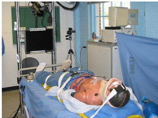
Fig. 3. The human patient simulator staged as a car accident victim.

trauma victim was a METI ( http://meti.com/ ) human patient simulator, or mannequin. This state-of-the-art mannequin can be programmed to act and respond in a life-like manner. For example, its pupils dilate in response to light, its chest rises and falls when breathing, and its heart rate, breathing pattern and blood oxygen levels respond to drug injections and medical procedures. We programmed the mannequin to show all symptoms of the worst-case difficult airway, and we dressed and positioned the mannequin to portray a car accident scenario as realistically as possible as shown in Fig. 3.