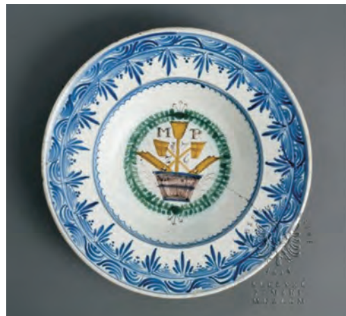
Moravian dish, 1726 Silesian Museum

remain many questions concerning museums in virtual environments (e.g. real vs. virtual visitor experience, loss of authenticity of digitized items and so on), the digitization and online presentation have become an integral part of the work of modern museums. Visitors have already found their way to the virtual place. It is the turn of museum professionals to become more involved in online presentation and communication. We hope that the number both of museum institutions and presented items will increase in close future so that eSbirky becomes the real aggregator of digital resources.