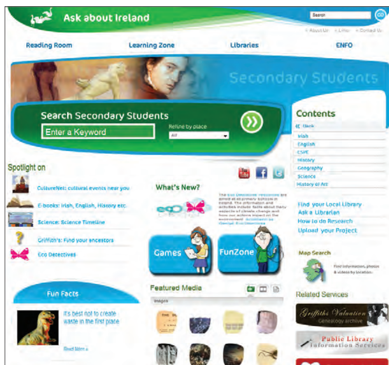
Secondary Students' homepage

In addition to the primary and secondary content, the other main features of the site provide a substantial resource for students learning. The Reading Room offers access to