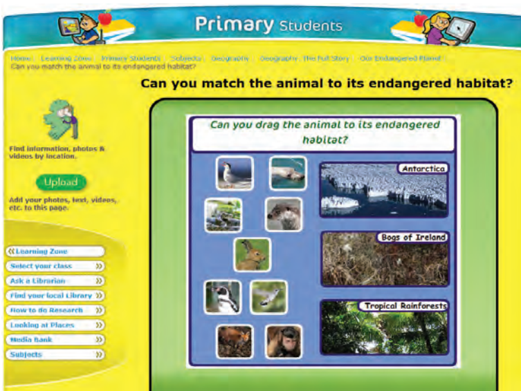
Interactive activity in the Primary Students' section

The Secondary Students' section offers a wide variety of content to support the Post-Primary Curriculum and provides students with authentic materials to support a researched-based learning approach. The strong interactive element to the Learning Zone encourages students to learn through exploration and inquiry and especially supports the development of critical thinking skills. There are lots of original photographs, maps, drawings, pictures and audios from all over the country, together with a wide range of educational games.