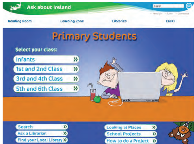
Primary Students' homepage on AskaboutIreland.ie