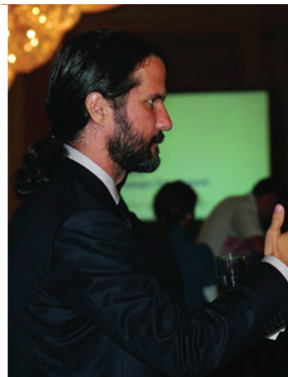
A discussion during the coffee break at the NALIS Forum