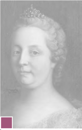
Martin van Meytens 1750-1760

The Červený Kameň Museum in Častá has been a part of Slovak National Museum since 1979. Its collections are focused on the history of the Červený Kameň Castle and indoor culture of the Slovak aristocracy.