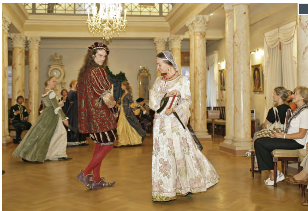
Performance in the Column Hall of the Museum of the History of Riga and Navigation.