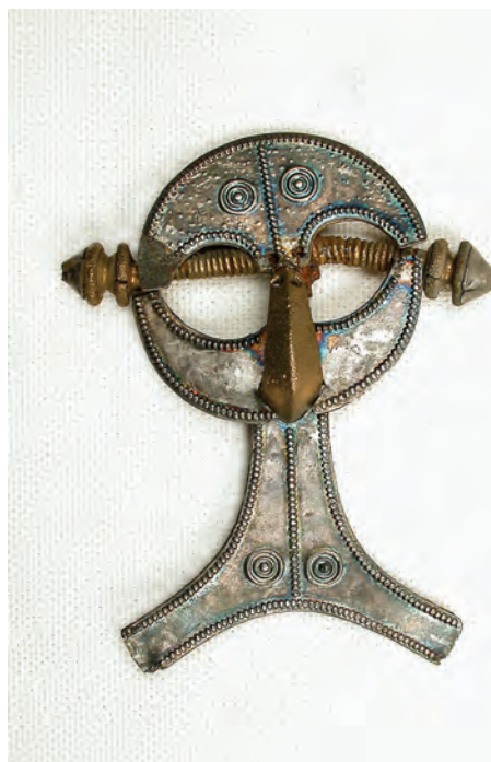
Pucessakta (Owl fibula). Aglonas Kristapinu cemetery. 153 rd tomb. 9 th century. Bronze, silver, iron. Dimensions 10.6 x 8.7 cm. National History Museum of Latvia collection.